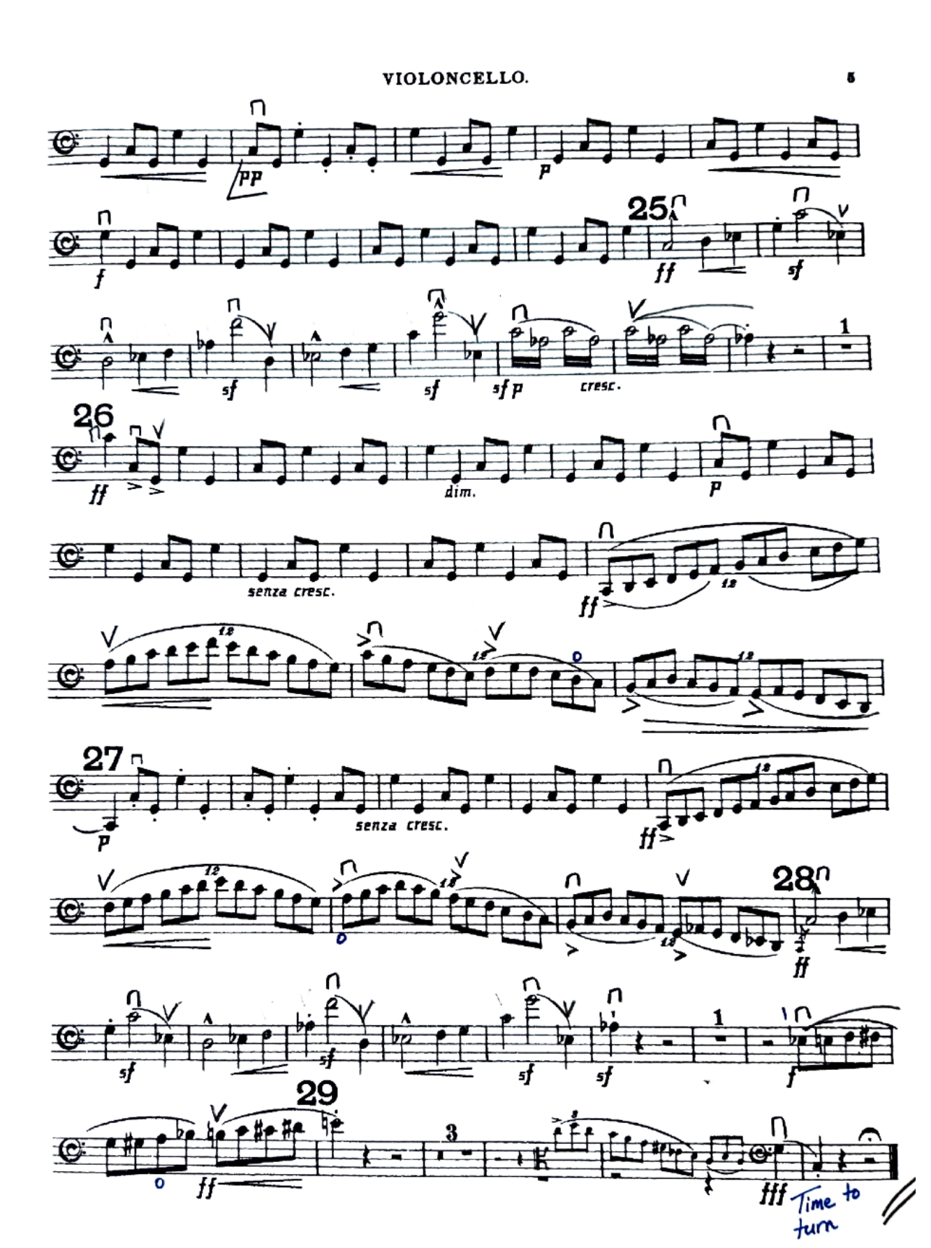
Excerpt No. 2 – 7<sup>th</sup> Variation, Rehearsal 25 through Rehearsal 29