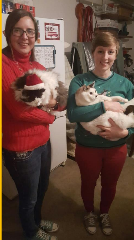
The household cats are a source of unexplained fascination to party-goers