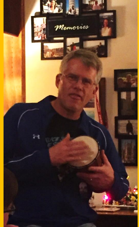
Sighting of “Bongo Boy” with his Congo toy