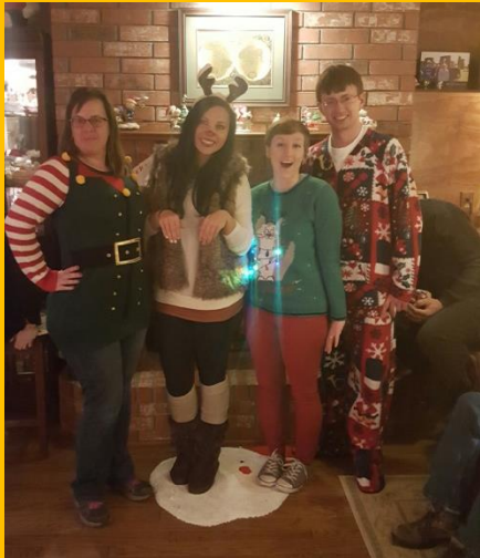
Finalists for the Ugly Sweater award