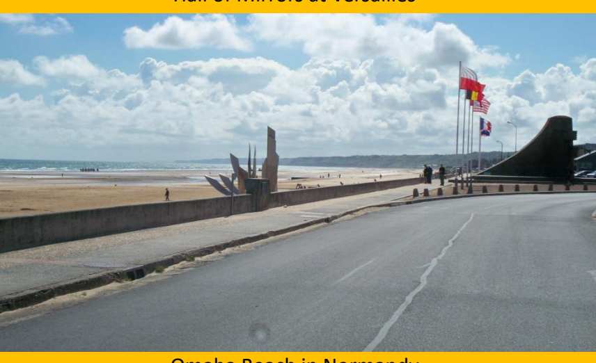
Omaha Beach in Normandy