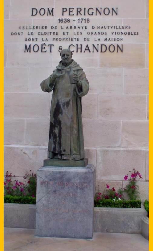
A very wise man...