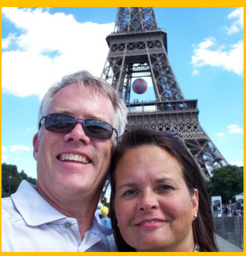
Note the football hanging under the tower for Euro 2016 Finals