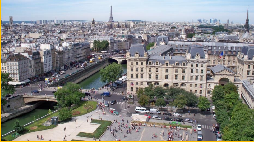
The Seine from the top of Notre Dame Cathedral