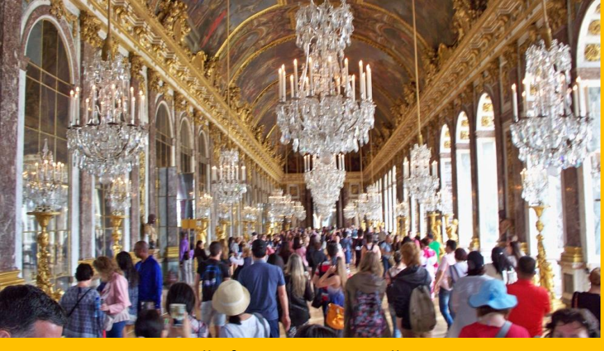
Hall of Mirrors at Versailles