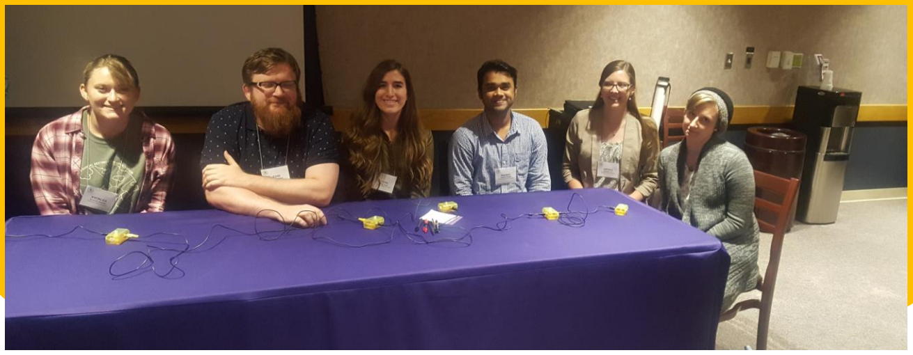
Team OSU right before the GeoBowl competition.