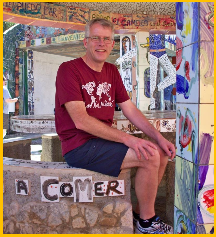
2015: Not "A Comer"