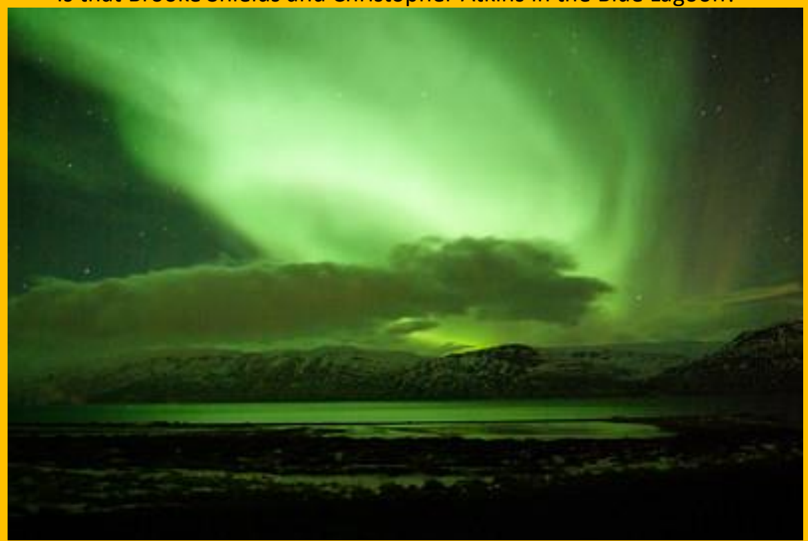
Yep, the Northern Lights are a real thing!