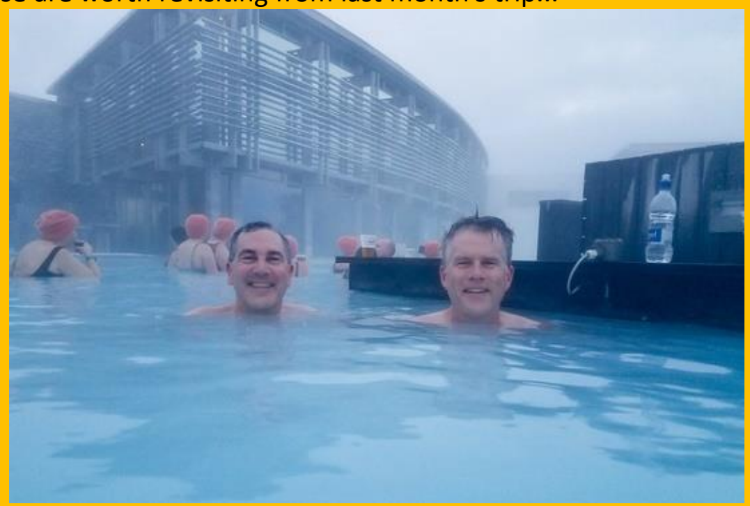
Is that Brooke Shields and Christopher Atkins in the Blue Lagoon?