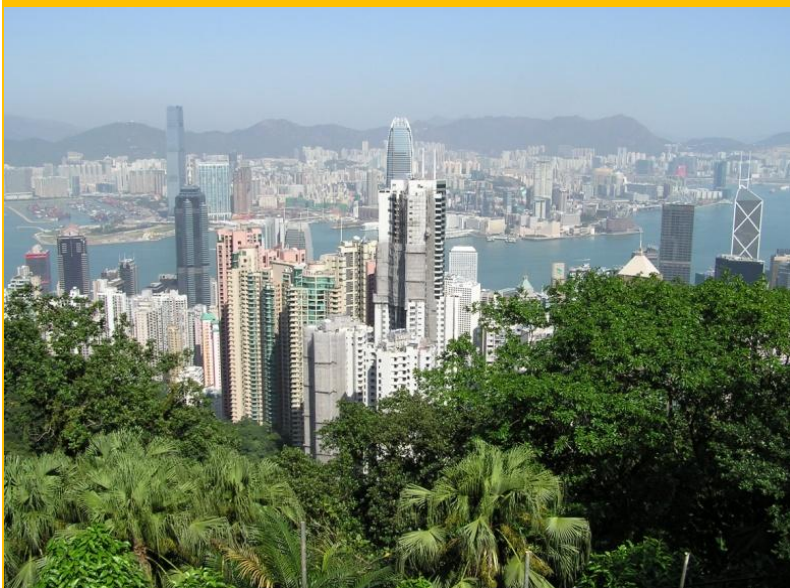
A view of Hong Kong and Kowloon from Victoria Peak