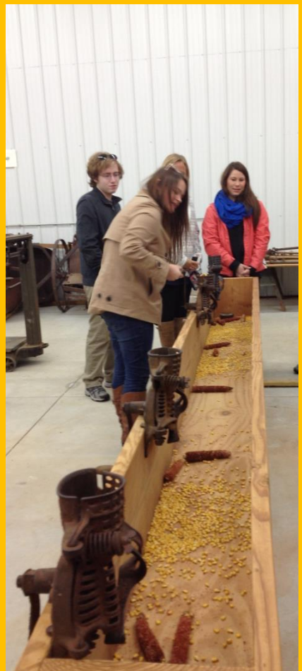
Shelling corn in Perkins