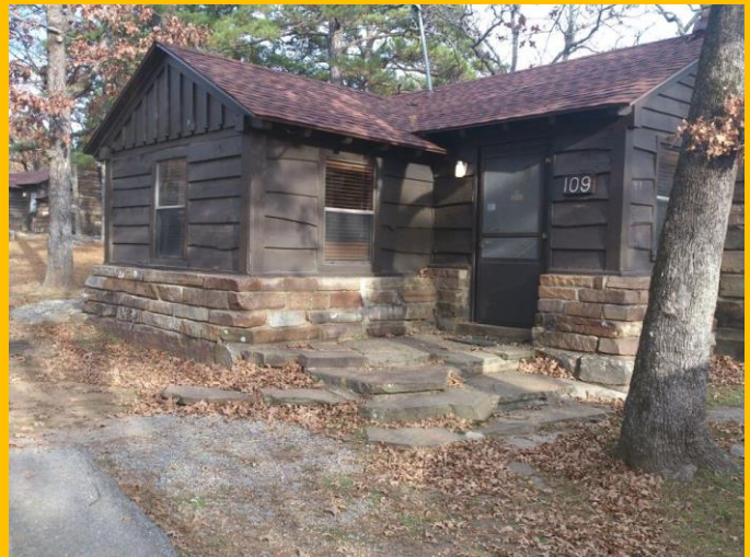
The cabins