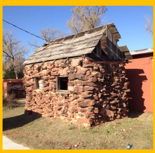
Rest stop, Route 66 style

After lunch the group headed east along old Route 66 to see the eclectic pop culture museum and the original 1926 alignment of Route 66. The group continued on to Luther, Wellston, and Warwick and visited the Seaba Station Motorcycle Museum, which is also home to the purported "first flush-toilet Route 66 public restroom west of the Mississippi" (or something like that—but they don't flush so well anymore), then on to Chandler and the UFO garage before finishing up in Chouteau (Mayes County). There the group viewed farm settlement patterns, house characteristics, and barn types along the back roads of the Oklahoma Amish Triangle, visited an Amish grocery store, and ended the evening with a carb-packing, familystyle Amish supper at the Norman Miller farm near Mazie.